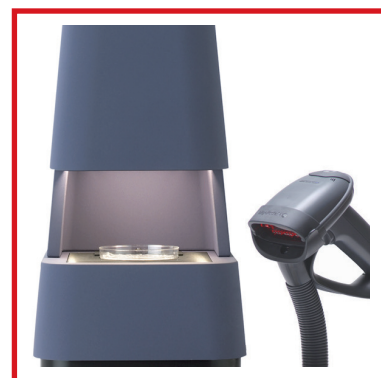
Barcodes allow the system to identify every plate automatically