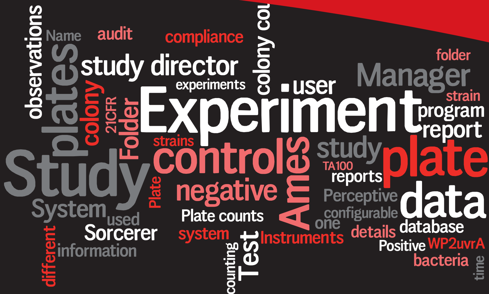
plate counting, data management and reporting for the ames test